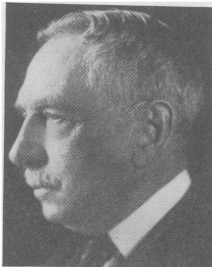
DR. HENRY FAIRFIELD OSBORN, who was President of the American Association for the Advancement of Science during 1928.

The archaeological and paleontological work of the American Museum of Natural History in Asia was suspended because of interference by Chinese authorities.