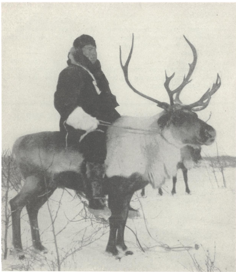
Santa Claus Cavalry