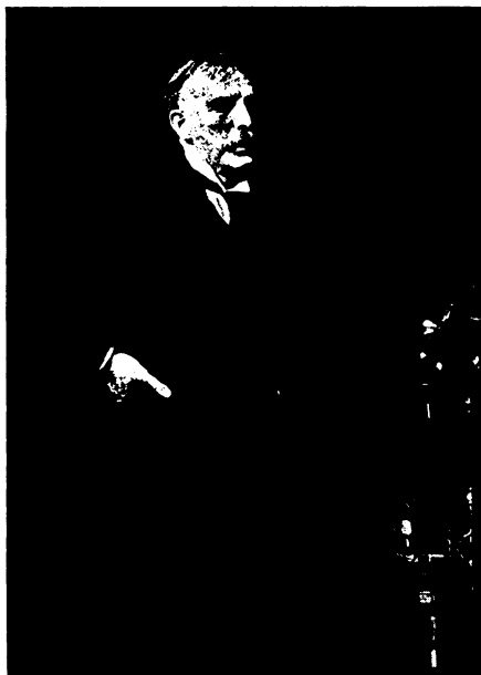
RUTHERFORD OF NELSON