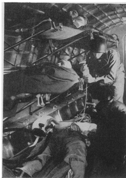
LIFE-SAVING ALOFT —This U.S. Army Air Forces photograph shows how blood plasma can be administered aboard an Air Transport Command plane.

amount that would be emitted by a single atom making one vibration per second, if that were possible, has been somewhat enlarged by new measurements made by X-rays and agrees satisfactorily with results calculated from the atomic theory.