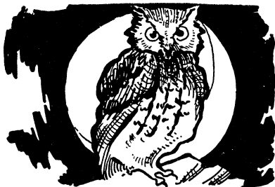
An Owl Howled

► THE CLASSIC anecdote, about the Cockney who was reassured that a weird sound he heard in the dark woods was "only an owl," and demanded to be informed "Wot in 'Eaven's nyme was 'owlin'?" may not be a joke on the Cockney after all. He may have had an innate feel for the onomatopoeic link between owls and howls—despite the lack of likelihood of his recognition of it under such terminology. We think of owls as hooting birds; it is not at all improbable that our grandsires thought of them as howling fowl.