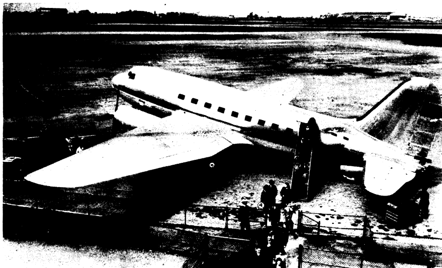
FASTEST TRANSPORT —The CW-20E Curtiss Commando will look like this and will have many innovations to assure greater comfort, safety, and economy of operation in the postwar future.