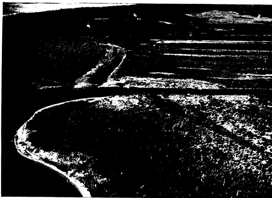
WESTERN ALASKA —The village of Tuliksak, situated on the Kuskokwim river, is typical of native settlements in the interior of the Territory. The Kuskokwim is the second largest river in Alaska.