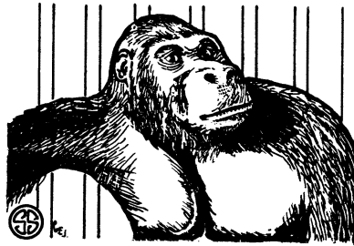
Down From the Trees

➤ MAN'S ANCESTORS may have got started toward becoming human simply by growing too big to hang around on the old family tree. If our remoter forebearers really were tree-inhabiting animals (whether they swung by their tails or not) they must have been relatively small. Very few animals that make their homes permanently in the tree-tops weigh more than 15 or 20 pounds, and most of them are much smaller—squirrel-sized rather than monkey sized. Among the heaviest are the sloths—and see how cautious they have to be, to avoid falling to the ground where the jaguars can get them!