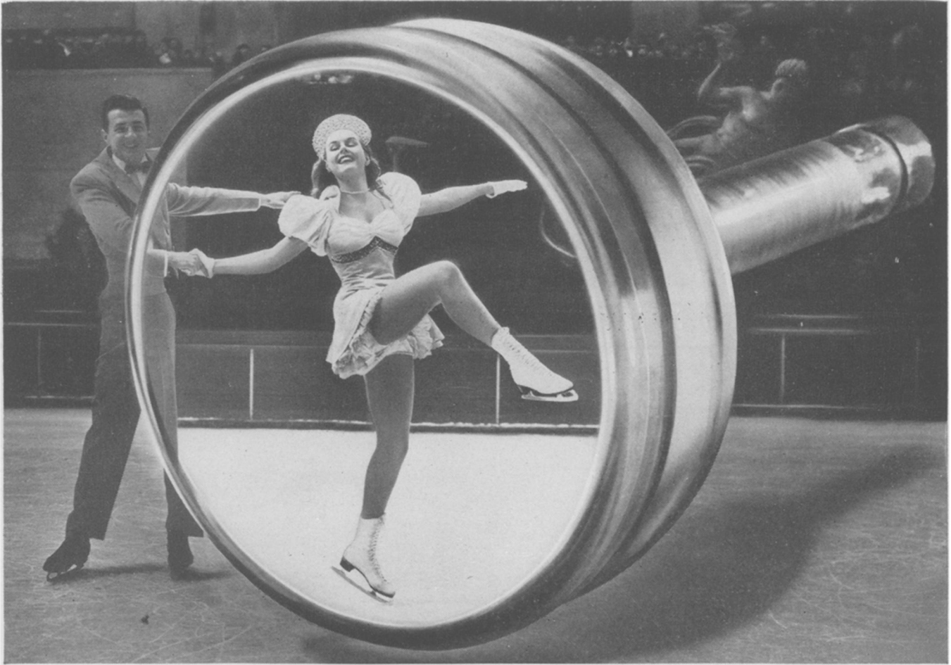
Television today is clearer, sharper, and brighter—thanks to the improved kinescope, or picture tube, perfected at RCA Laboratories.