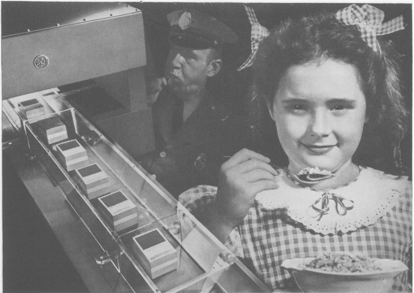
The RCA Metal Detector "blows the whistle" on any particle of metal that may have crept into the package.