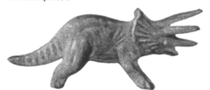
TRICERATOPS Late Cretaceous period