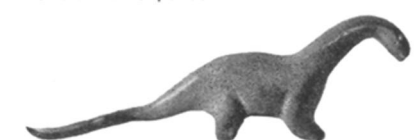
BRONTOSAURUS Upper Jurassic period