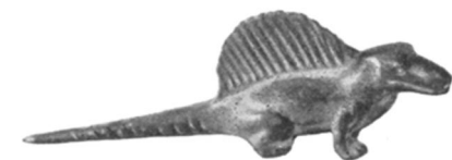
DIMETRODON Permian period

Authentic Museum of Natural History miniatures cast in royal bronze