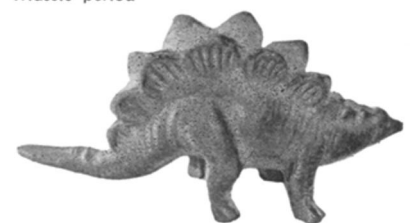
STEGOSAURUS Jurassic period