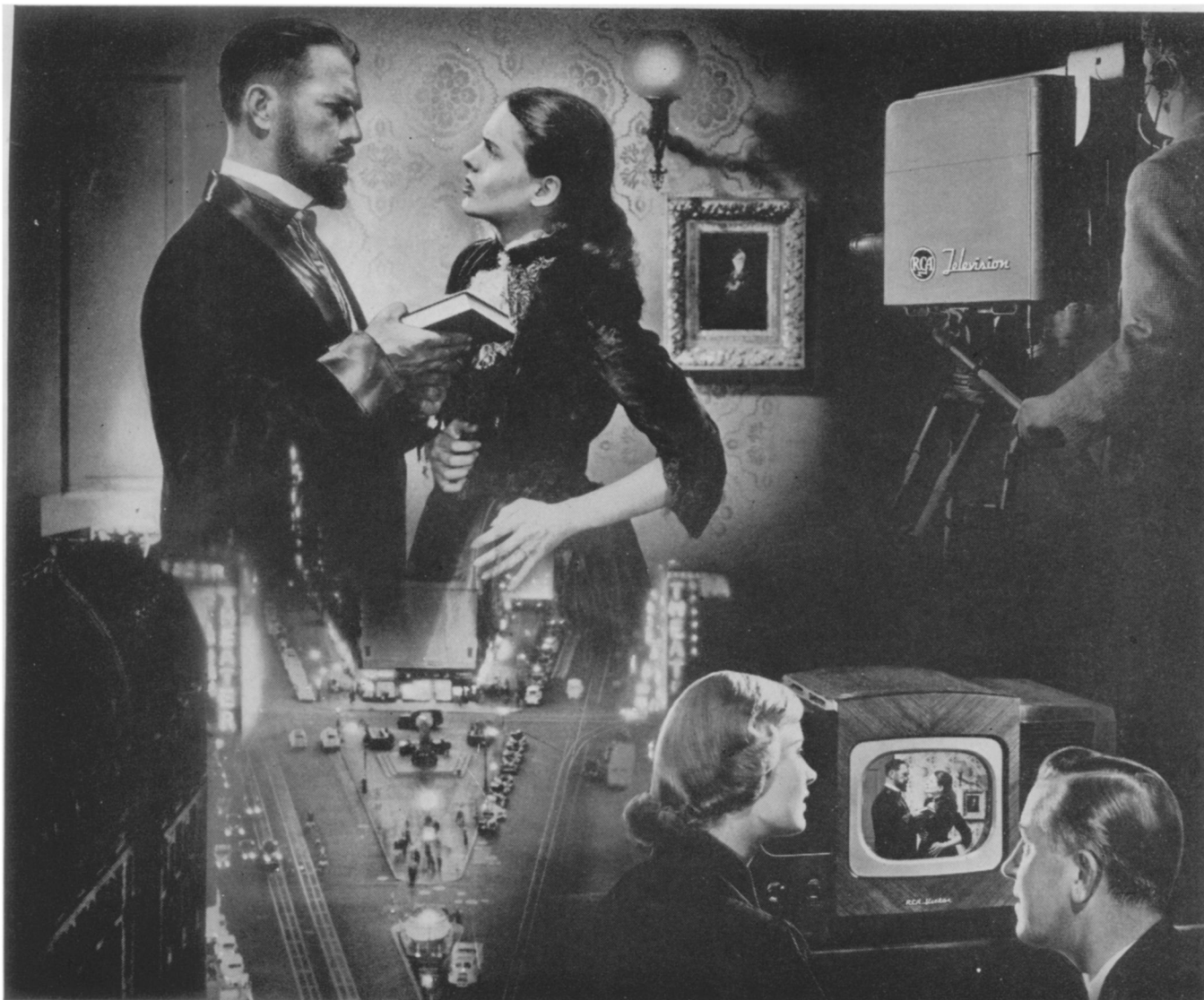
Great drama comes to television in NBC telecasts of Theatre Guild presentations.