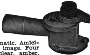
Fig. 2 in. diameter objective. All lenses Achromatic. Amici-prism erects the image. Four built-in filters—clear, amber, neutral and red. Slightly used condition but all guaranteed for perfect working order. Weight 5 lbs. Can be carried but a trifle bulky. Excellent for finder on Astronomical Telescope. Stock No. 943-Q ..... $27.50 Postpaid