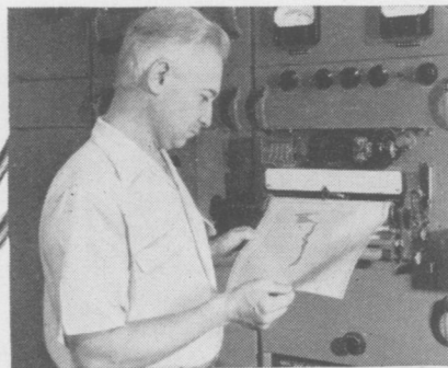
Automatic recorder plots sound pressures developed in the ear canal at different frequencies.

Now, sound costs money. To deliver more of it to your ear means bigger wires, more amplifiers. So Bell Laboratories engineers, intent on a thrifty telephone plant, must know how much sound reaches the ear, how much leaks away. They mounted a narrow "sampling tube" on an ordinary handset.