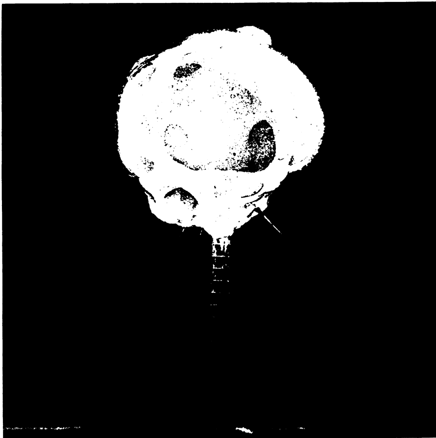
FROZEN EXPLOSIONS —This fiery ball from what the Atomic Energy Commission reservedly calls the explosion of a "nuclear device" on March 17 of this year was stopped photographically in a few millionths of a second by a super-speed camera just before it disintegrated the steel tower shown below it. The camera, called the Rapatron, has an electronic shutter and no moving parts. A single exposure type, it was built by Edgerton, Germeshausen & Grier, Inc., of Boston.

age, and the third ever found, was caught off Madagascar.