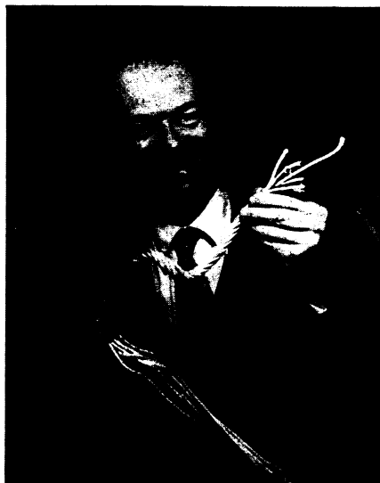
TWISTED STRANDS OF LIFE — Dr. Linus Pauling, California Institute of Technology chemist, demonstrates with strands of rope how strands of molecules are twisted into the structure of protein. Such studies may explain the nature of living matter, as scientists learn to unravel the rope-like form, and may also yield clues to cancer's cause and cure.

Measurements of electric charges on cloud droplets and the electric field of natural clouds suggested that the reason certain clouds produce rain and others remain unproductive may be related to electrification.