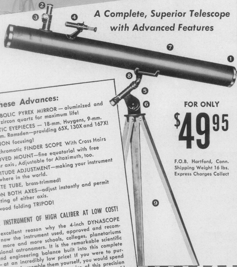
A Complete, Superior Telescope with Advanced Features

is now used and approved by over 40 colleges and professional institutions