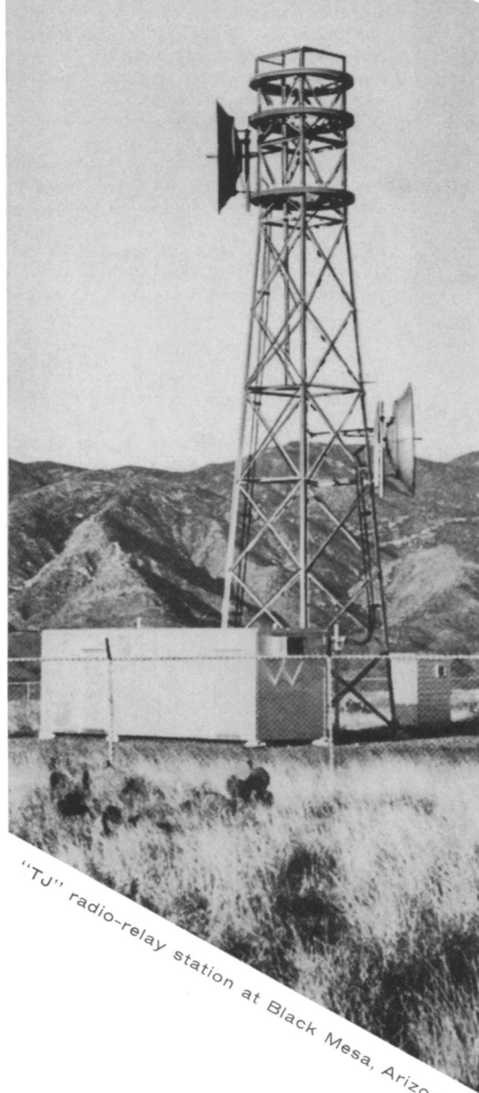
"TU" radio-relay station at Black Mesa, Arizona

In Arizona, the telephone company faced a problem. How could it supply more telephone service between Phoenix and Flagstaff—through 135 miles of difficult mountain territory?