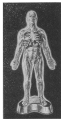
TO SCALE This is a 3-dimensional Model 16 inches high