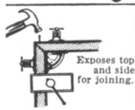
Exposes top and side for joining.