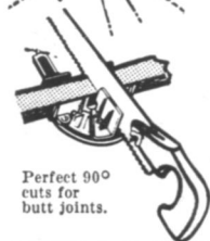
Perfect 90° cuts for butt joints.

Advanced design — two tools in one — lets you make perfect picture frames, screens, storm windows, etc. in half the time!