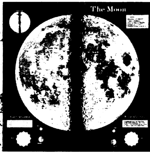
WALL SIZE MAP OF THE MOON