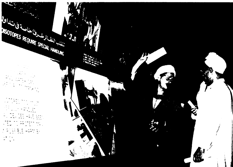
ATOMS AT WORK —A U. S. Atomic Energy Commission exhibit, designed to show the free world the increasing importance of nuclear energy in everyday life, was opened in Lahore, Pakistan. Invitations were sent to Pakistan clubs, affiliated with Science Clubs of America. An essay contest on the subject, "What can atomic energy do for Pakistan?" is being sponsored by the U. S. Information Service for local students.

• Science News Letter, 78:323 November 19, 1960