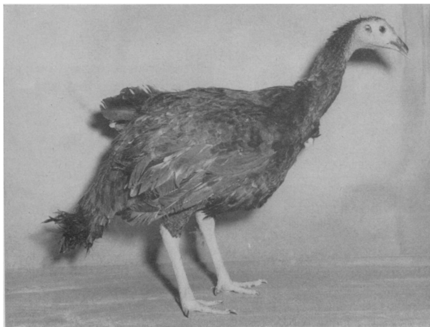
CHURK —This unimpressive looking bird is really most unusual. He is the result of a history-making cross between a chicken and a turkey—the first known case where two families of birds have been hybridized successfully.

Although poultry raisers will not be able to produce it, a cross between the