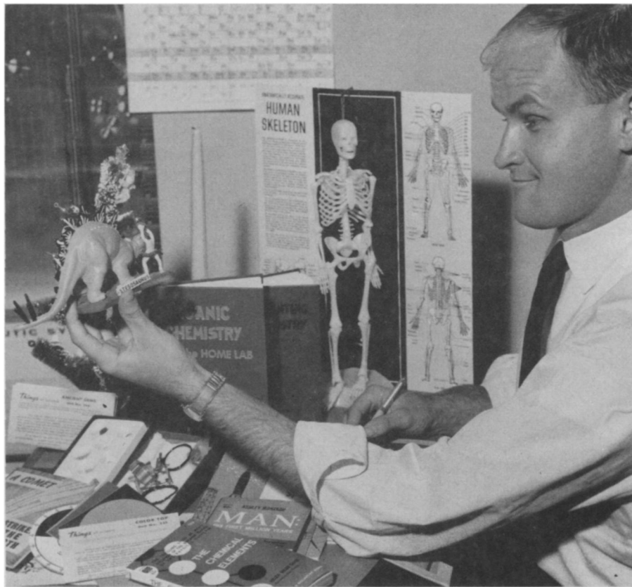
SCIENCE BARGAIN—Low-cost science gifts bring a pleased look to Father's face as he anticipates Christmas.