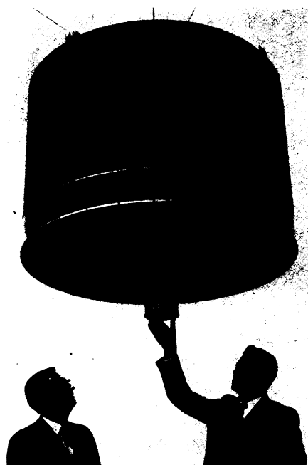
TV SATELLITE—Mock-up of the communications satellite that will establish uninterrupted television programming.

• Science News Letter, 82:101 August 18, 1962