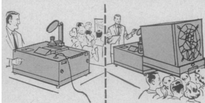
OVERHEAD PROJECTION and with ZOOM!

New versatility in microprojection makes it easier than ever to show microscope slides or living specimens to small or large groups!