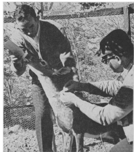
University of Rhode Island

TIME OUT FOR MEASUREMENT —This wild deer is being fitted for an "electronic collar" of a miniature radio transmitter, loop antenna and power supplies that will help wild-life biologists track and study the daily movements of wild deer. The deer was caught with the help of powerful drug "bullets" that immobilize the animal for 30 minutes while being fitted.