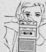
press . . . and play

DUAL CARRYING CASE. Recorder fits in rich black vinyl case with separate pouch for microphone. Has convertible shoulder strap.