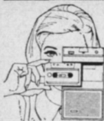
snap in cartridge

ONE SWITCH CONTROL , the simplest way to record/playback. Single master control lets you start, stop, fast wind, fast rewind tape. (Built-in interlocking safety button.)