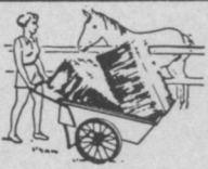
Stock or Poultry!