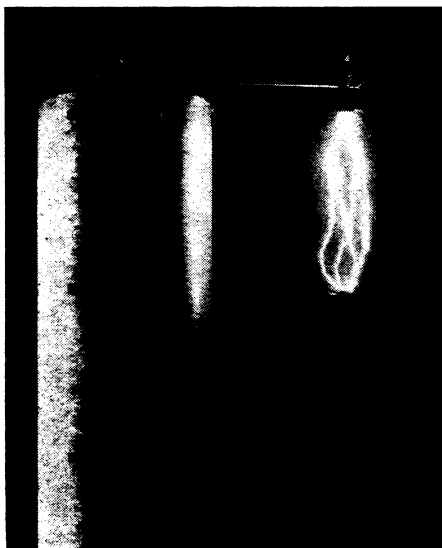
INSTRUMENT RESEARCH CO.

THE WONDERS OF NATURE OUTSHINE THE BRILLIANCE OF MAN—A compact, million-volt impulse generator can deliver in 50 billionths of a second more power than is generated by Niagara Falls, but its power is outshone by a bolt of lightning caught striking the top of the State Capitol dome in Olympia, Wash. Nature's stroke was photographed with a Hasselblad 2\frac{1}{4} \times 2\frac{1}{4} single lens reflex camera during a 30 second time exposure at f/8 on Tri-X film.