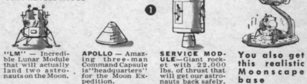
"LM" - Incredible Lunar Module that will actually land two astronauts on the Moon.