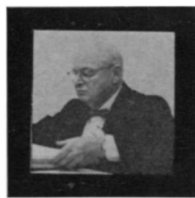
COVER —Watson Davis, director emeritus of Science Service, died June 27 in Washington, D. C., of cancer. He was 71.

Subscription rate: 1 yr., $6.50; 2 yrs., $11.50; 3 yrs., $16.50. Special trial offer for new subscribers only: 39 weeks, $3.43. Single copy, 25 cents. No charge for foreign postage. Change of address: Three weeks' notice is required. Please state exactly how magazine is addressed. Include zip code.