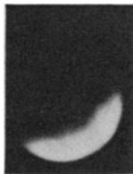
COVER —Even when photographed by ultraviolet light with the huge 120-inch telescope at the Lick Observatory, earth's mysterious near-twin, Venus, appears as little more than a smudge. P. 86.

Subscription rate: 1 yr., $6.50; 2 yrs., $11.50; 3 yrs., $16.50. Special trial offer for new subscribers only: 39 weeks, $3.43. Single copy, 25 cents. No charge for foreign postage. Change of address: Three weeks' notice is required. Please state exactly how magazine is addressed. Include zip code.