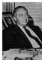
COVER: Dr. Kermit Gordon, president since July of the Brookings Institution, heads an organization that for years—sometimes aggressively, sometimes meekly—has been teaching Washington the facts of economic and political life. P. 232.

Subscription rate: 1 yr., $6.50; 2 yrs., $11.50; 3 yrs., $16.50. Special trial offer for new subscribers only: 39 weeks, $3.43. Single copy, 25 cents. No charge for foreign postage. Change of address: Three weeks' notice is required. Please state exactly how magazine is addressed. Include zip code.