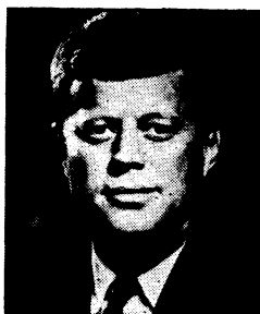
F. Rubin Bachrach ©