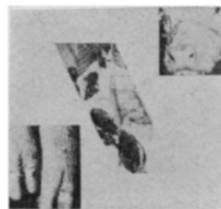
COVER—Foot and mouth disease, rampant in South America, threatens the livestock industry elsewhere with instant destruction. P. 300.

Subscription rate: 1 yr., $6.50; 2 yrs., $11.50; 3 yrs., $16.50. Special trial offer for new subscribers only: 39 weeks, $3.43. Single copy, 25 cents. No charge for foreign postage. Change of address: Three weeks' notice is required. Please state exactly how magazine is addressed. Include zip code.