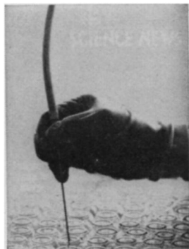
A Science Service Publication Vol. 92/December 9, 1967/No. 24 Science News Letter®

Preparation of vaccine for the World Health Organization's new 10-year campaign for the eradication of smallpox worldwide. The nature of the disease makes it, perhaps, the one ancient scourge susceptible to a deadline. P. 568.