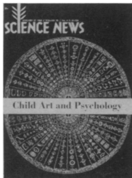
A Science Service Publication Vol. 93/January 27, 1968/No. 4 Science News Letter ®

Children's art, far from simple representations, develops in stages of abstract designs that could form the basis of a new approach to mental growth. P. 92