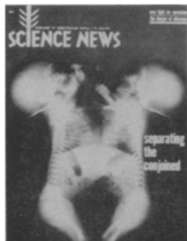
A Science Service Publication Vol. 93/February 17, 1968/No. 7 Science News Letter ®

Conjoined twins often present to surgeons a seemingly insoluble problem, as did these Swiss children. Joined at the breast, they shared critical internal organs. More superficial conjunction increases survival chances. P. 166