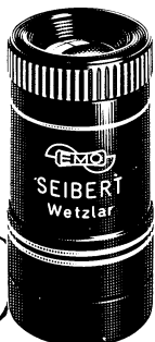
Shown actual size

We went to Wetzlar, Germany (world capital of fine optics) to find such perfection at such a price. Remove the EMOSKOP from its fitted leather case and it is a 30x microscope. A twist of the wrist converts it to a 3x telescope (ideal for theater, field or sky) or a unique 3x telescope-loupe. Another change and you have your choice of 5x, 10x or 15x magnifying glasses. The perfect vest-pocket companion for exacting professionals and scientists and all those who wish to observe anything closely and clearly. A most discreet opera glass. If you make a fetish of quality, the EMOSKOP will do you proud. Coated lenses, fully achromatic, absolutely flat field. Modern Photography Magazine calls the EMOSKOP "... the only magnifier worthy of the name."