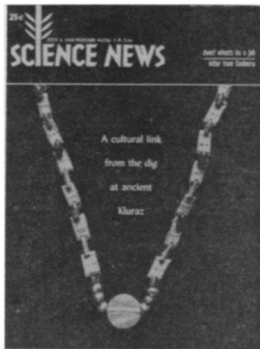
The moon on a string may have been on the mind of the designer of this necklace of gold and semiprecious stones, who fashioned it on the shores of the Caspian Sea some 2,700 years ago. p. 15.