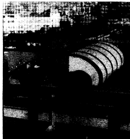
Sky-car model: partly up and away