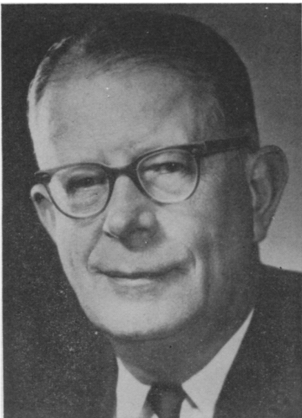
Wilbur: to meet people's needs.

aware that there is dissatisfaction with the way they perform their function, and are taking some steps to meet the criticism.