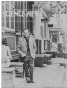
The Temple Community Mental Health Center in Philadelphia tries out new concepts aimed at deprived populations. With facilities located in row houses, it takes on the coloration of the neighborhood p. 345.