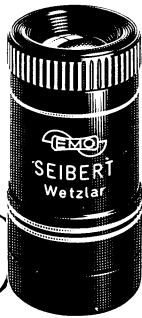
Shown actual size

We went to Wetzlar, Germany (world capital of fine optics) to find such perfection at such a price. Remove the EMOSKOP from its fitted leather case and it is a 30x microscope. A twist of the wrist converts it to a 3x telescope (ideal for theater, field or sky) or a unique 3x telescope-loupe. Another change and you have your choice of 5x, 10x or 15x magnifying glasses. The perfect vest-pocket companion for exacting professionals and scientists and all those who wish to observe anything closely and clearly. A most discreet opera glass. If you make a fetish of quality, the EMOSKOP will do you proud. Coated lenses, fully achromatic, absolutely flat field. Modern Photography Magazine calls the EMOSKOP "... the only magnifier worthy of the name."