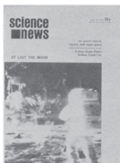
Ghostly they were, those two figures gliding over the surface of the moon. But, with all the world watching, it was certain. The dream of the ages had been fulfilled: Man was on the moon. p. 72