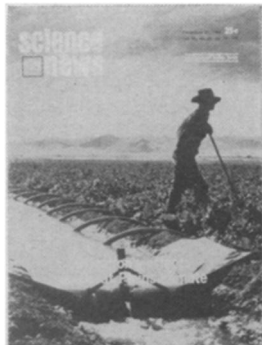
The remarkable expansion of irrigation on the Great Plains in the last few decades has been accompanied by increased rainfall. The two facts may be related. p.599