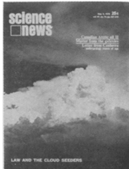
The growing ability to modify the weather on a limited scale raises social, legal and political issues. See p. 461.

A Science Service Publication Vol. 97/May 9, 1970/No. 19 Incorporating Science News Letter