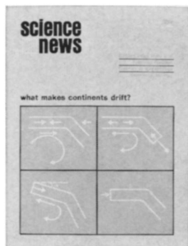
The forces deep in the earth's mantle responsible for the sea-floor spreading at the surface are still poorly understood. Some, or perhaps all, of the four mechanisms pictured here may be at work moving the earth's crustal plates. See page 74.

A Science Service Publication Vol. 98/July 25, 1970/Nos. 3 & 4 Incorporating Science News Letter