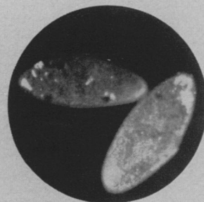
Darkfield unstained paramecium