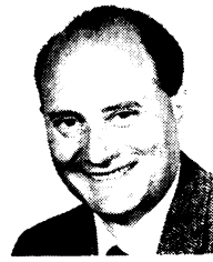
Lasker Foundation Benzer

For 26 years the Albert and Mary Lasker Foundation has presented annual awards for distinguished work in basic and clinical medical research. Twenty-two of the winners have later received the Nobel Prize. (Earl W. Sutherland, Marshall W. Nirenberg and H. Gobind Khorana are recent examples.)