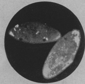
Darkfield unstained paramecium